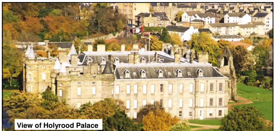
View of Holyrood Palace

These were well received and ACPOS further agreed that Stop It Now! Scotland material and helpline information would be routinely used by investigating police officers during enquiries and pro-